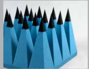
WAVASORB® VHP: Broadband Pyramidal Absorber

▲ E&C Anechoic Chambers NV Nijverheidsstraat 7A B-2260 Westerlo Belgium