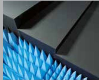
WAVASORB® VHP FL: Walkable Floorabsorber