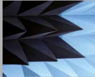
WAVASORB® HFX/HFS: High Power Absorber