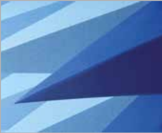
WAVASORB® VHP CO: Coated Absorber